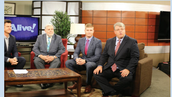
PA Live Taping